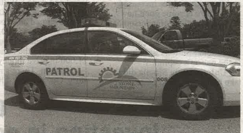
Improved lighting and increased security are two main benefits of the year-old Stone Mountain Community Improvement District which has a goal of creating 2,000 jobs by the end of 2013. Currently, the district has two million square feet of empty commercial space in the district.